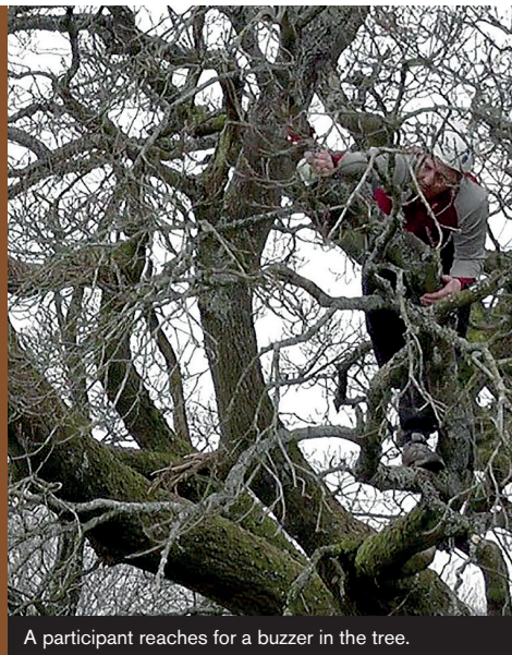
A participant reaches for a buzzer in the tree.

In comparing their data to those for our closest living relatives, the great apes, Emily and Nardie are developing insight into how bipedal locomotion and the complex cognition of our common ancestors evolved.