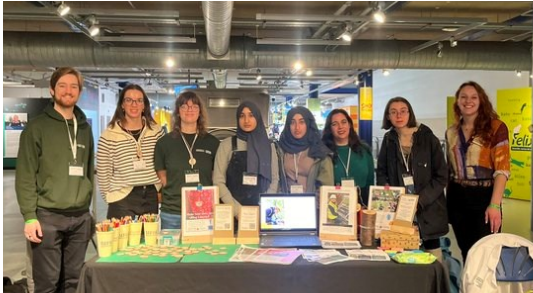
Above: BIFoR team at the Women in STEM event at the Thinktank, Birmingham. The stand was very popular with passersby and 5 of the rapidly expanding ' BIFoR Outreach and Education ' team gave inspiring lectures.