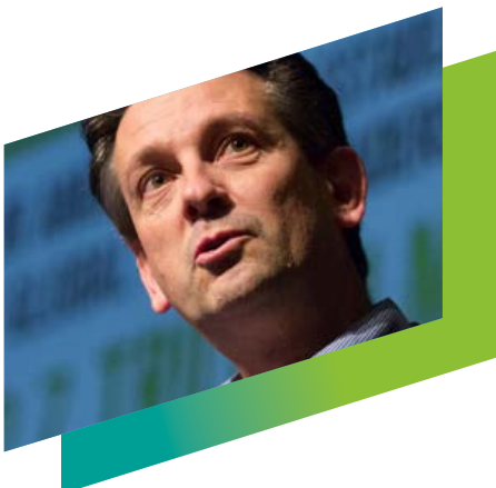
Lord Karan Bilimoria of Chelsea President, CBI