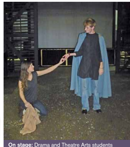
On stage: Drama and Theatre Arts students