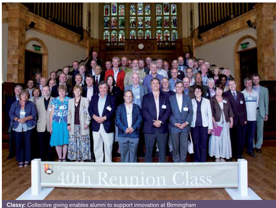
Classy: Collective giving enables alumni to support innovation at Birmingham

For further details about class giving, visit www.alumni.bham.ac.uk/fund or call Natalie Elderfield on +44 (0)121 414 6879.