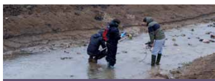
Environmental monitoring: Students collecting water samples from Bourn Brook