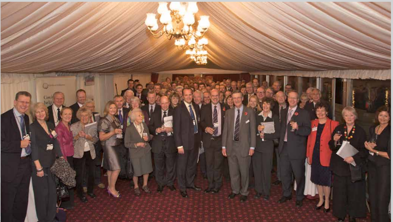
Launch party: Alumni, friends and guests in the House of Lords' Cholmondeley Room celebrate the official launch of the Circles of Influence campaign