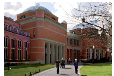
Future: How the completed building will look