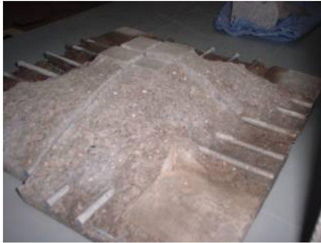
Figure 3: Incomplete solid revolution punched out from main slab.