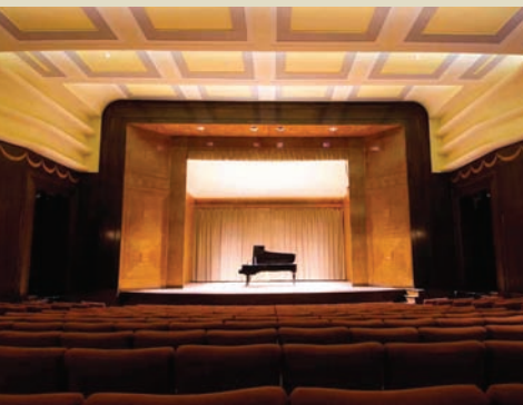
The Barber Concert Hall

University of Birmingham, Edgbaston, Birmingham, B15 2TS