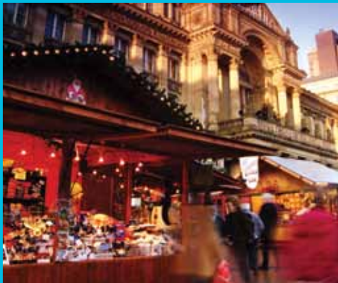
Birmingham's Frankfurt Christmas Market; the largest outdoor Christmas market in the UK