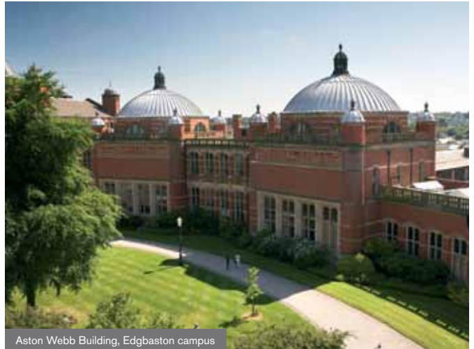
Aston Webb Building, Edgbaston campus