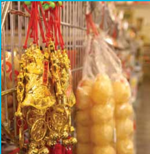
Asian supermarket, Birmingham city centre