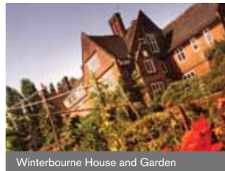
Winterbourne House and Garden