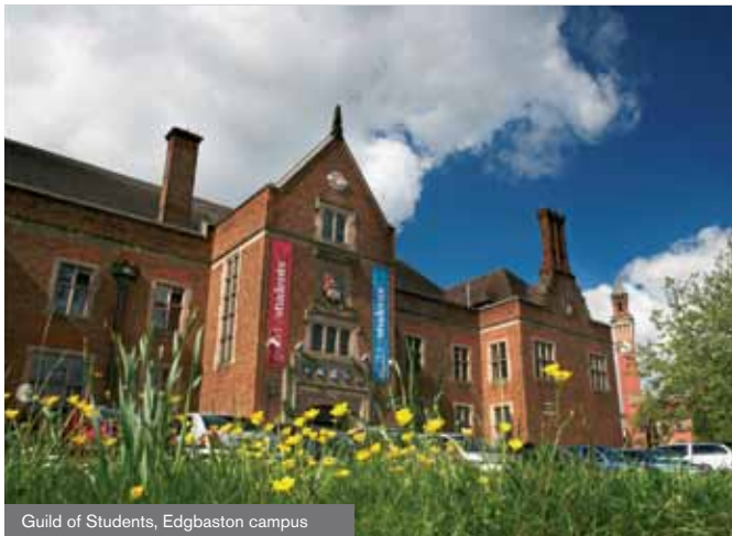
Guild of Students, Edgbaston campus