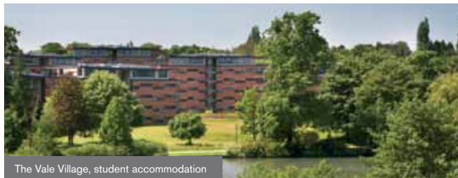
The Vale Village, student accommodation