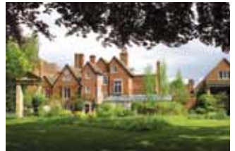
Shakespeare Institute, Stratford-upon-Avon