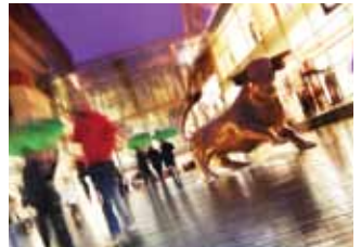
Bullring shopping centre