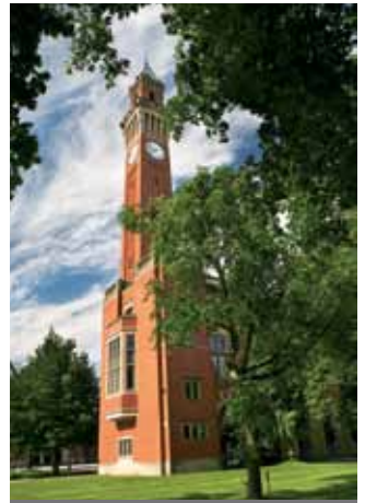
Clock Tower, Chancellor's Court