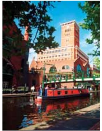
Birmingham city centre