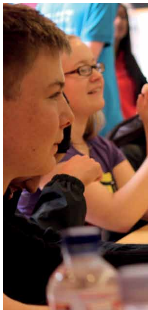
Enjoying lunch on campus during residential