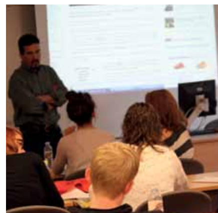
so that you can construct a programme for your pupils beginning at the transition from primary to secondary school, through the secondary phase to preparation for the transition to higher education. The diagram below shows our activity, and how it might link together into a programme for students. Please contact outreach@bham.ac.uk if you would like to talk about this further.