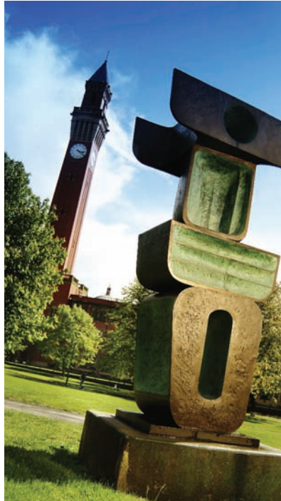
Ancestor I by Barbara Hepworth