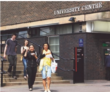
University Centre (R23)