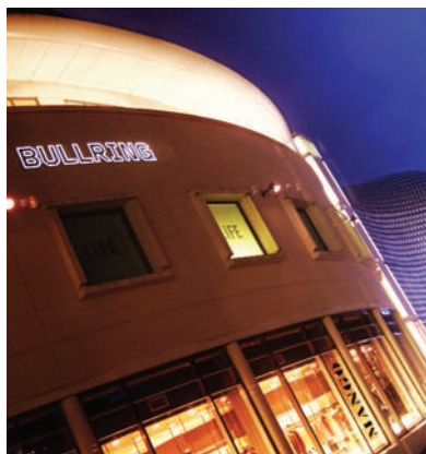
Bullring shopping centre