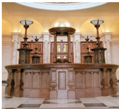
Aston Webb reception (R6)