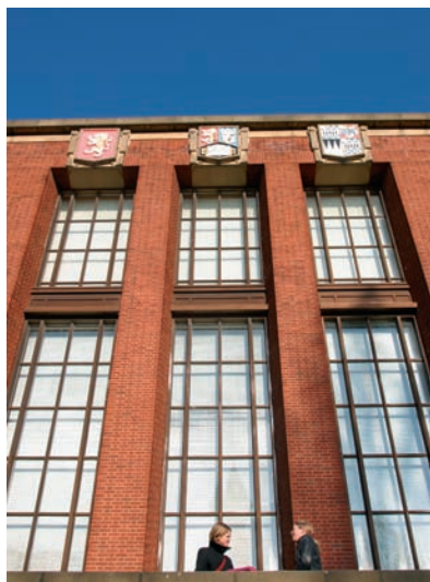
Main library (R22)