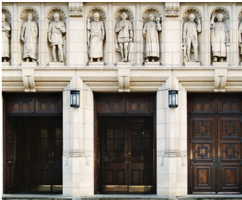
Entrance to Aston Webb Building (R6), featuring a frieze of nine figures from the worlds of art, philosophy, science and industry