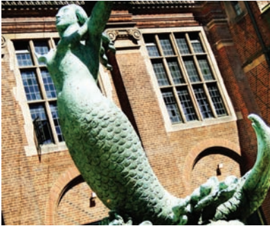
Mermaid fountain – The Guild (01)