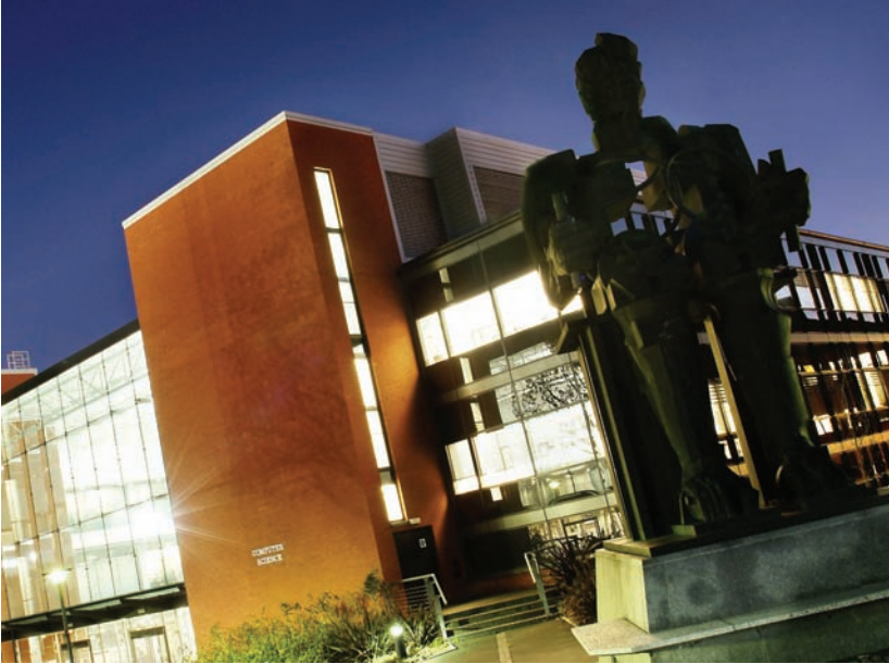
Computer Science building and Faraday statue (Y9)