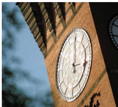
'Old Joe' Clock tower

Walking straight ahead and under the clock tower (if you're not superstitious) you will go through the archway to enter the main University Square. On your far right is the Arts Building (R16) and ahead is the Library (R22) . The Law Building (R1) is behind you facing the Library. Beyond the Library you will see the architecturally distinctive Muirhead Tower (R21) .