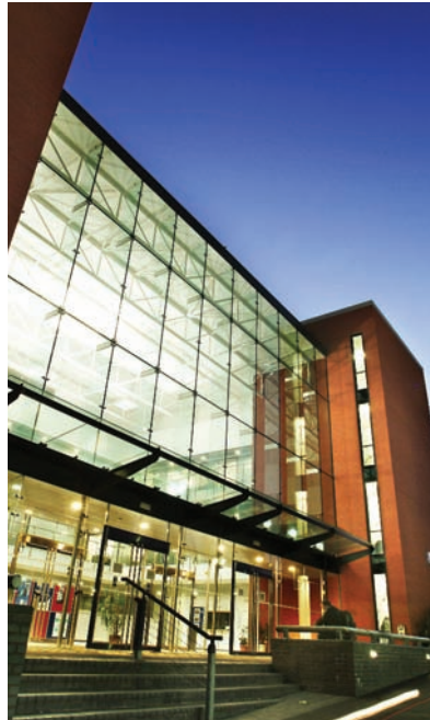
Learning Centre (R28)