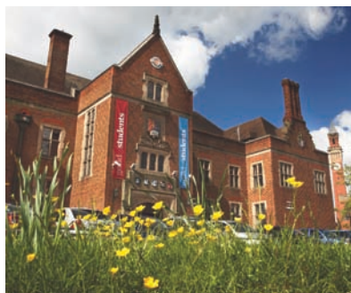
Guild of Students (01)

On leaving the Guild, retrace your steps back towards University Square, this time crossing the Square towards Staff House (R24) with the clock tower on your left-hand side. Continue walking straight ahead so that you walk under the archway next to Staff House and into University Centre (R23) where you will see Waterstone's bookshop and Rymans stationery shop on your right.