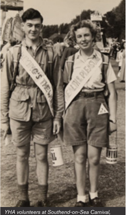
YHA volunteers at Southend-on-Sea Carniva 1954. Ref YHA/LG/2/ALL/3