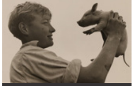
A member of the YMCA British Boys' for British Farms scheme holding a piglet. Ref YMCA/7/1/25/136

The scheme became recognised by the National Farmers Union and other agricultural bodies, and part funded by the Ministry of Agriculture. The scheme became a forerunner to Farm Institutes and Agricultural Colleges.