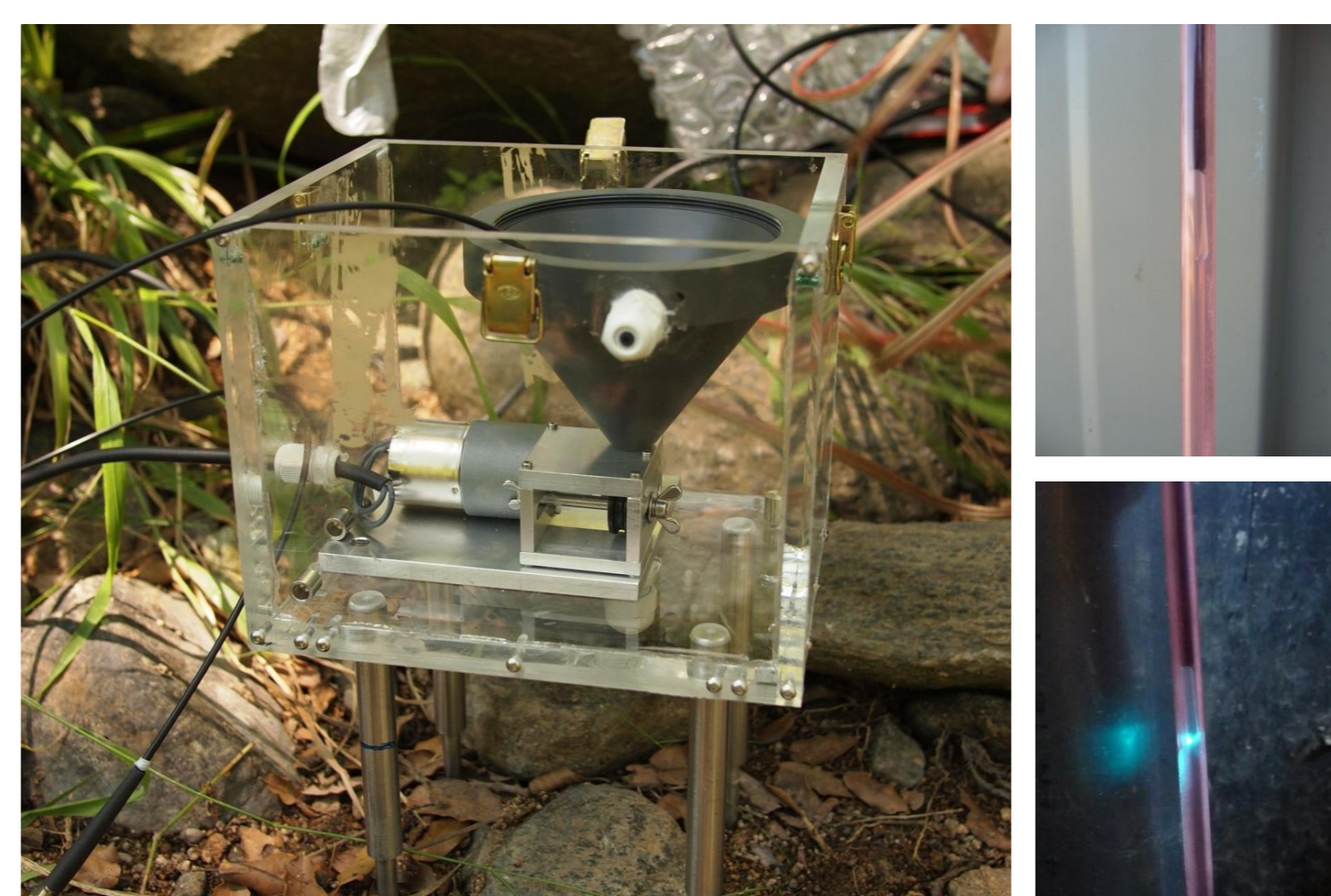
Fig. 2: Prototype of the miniDOS prior to installation in situ . Left panel: control unit (not shown here: power supply, fiber optic oxygen transmitter, controller unit). Right panels: side-firing POF in tubular oxygen probe.