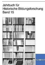
Visions of history, versions of education: assessing the state of the art in the history of education ( http://www.klinkhardt.de/verlagsprogramm/1727.html ). Grosvenor and Myers, 2010