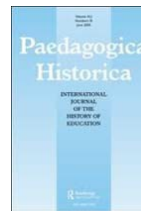
Society, education and the state: Gender perspectives on an old debate

( http://www.tandfonline.com/doi/abs/10.1080/0046760X.2013.796779#.UswAR6FFDcs ) . Watts. 2013