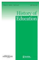
Putting education in its place: space, place and materialities in the history of education

( http://www.tandfonline.com/doi/abs/10.1080/0046760X.2010.514526#.UsvqOaFFDcs )