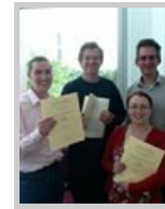
The editors of the Vetus Latina Iohannes

This first fascicle of the printed edition, published by Herder in the Vetus Latina series, comprises a brief Guide for Users, a new edition of the earliest series of Latin chapter titles and the text of all surviving manuscripts and quotations for John 1,1 to 4,48.