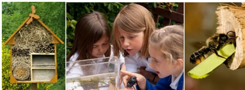
Left, bee hotel at UoB. Centre, children investigating how long a water beetle can swim using one bubble of air. Right a leafcutter bee using a bee hotel.