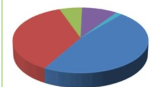
First destinations of University of Birmingham Biosciences graduates six months after graduation

The University and the School of Biosciences provide a range of services to support you in finding a career and to build a CV that stands out from the crowd. Our skills modules and