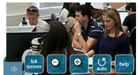
Take virtual tours of some of our facilities (http://www.birmingham.ac.uk/schools/gees/facilities)

Studying with us you will benefit from cutting edge equipment and facilities in the School of Geography, Earth and Environmental Sciences, including our state-of-the-art Earth imaging and visualisation laboratory for teaching.