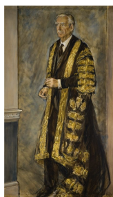
The Rt Hon Anthony Eden, Earl of Avon

(/Images/Past-Chancellors/Viscount-Cecil-of-Chelwood.jpg)