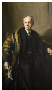
The Rt Hon Robert Cecil, 1st Viscount Cecil of Chelwood

(/Images/Past-Chancellors/Rt-Hon-Joseph-Chamberlain.jpg)