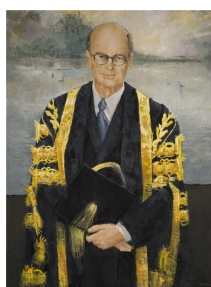
Sir Peter Scott

(/Images/Past-Chancellors/Rt-Hon-the-Earl-of-Avon.jpg)