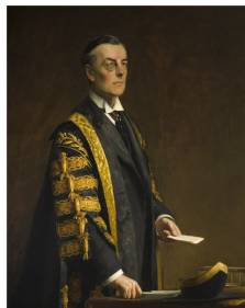
The Rt Hon Joseph Chamberlain

The University has had seven Chancellors since it received its Royal Charter (/university/governance/Legislation/index.aspx) in 1900: