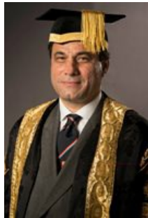
Lord Bilimoria of Chelsea CBE, DL

Sir Dominic was made Chancellor of the University on 2 May 2002. He is currently a Senior Adviser to the Financial Services Authority. He was knighted in the Queen's Birthday Honours List in June 1997. He was Chairman of Cadbury Schweppes where he spent his career. For six years he was Chairman of the Wellcome Trust, and he was also Chairman of The Economist and of Misys plc. He has been involved in many aspects of education through the CBI where he was Chairman of its Education & Training Committee and was Deputy Chairman of the Qualifications & Curriculum Authority. He is Vice-President of Edgbaston High School for Girls; he was a Fellow of Eton College and a Trustee of the Teaching Awards Trust which honours outstanding teachers at an annual "Oscar" ceremony shown every year on BBC TV.