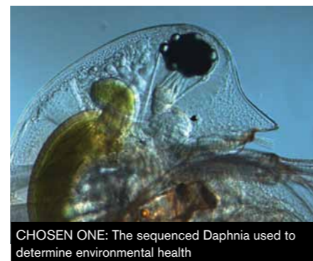
CHOSEN ONE: The sequenced Daphnia used to determine environmental health

Learn more www.birmingham.ac.uk/schools/biosciences