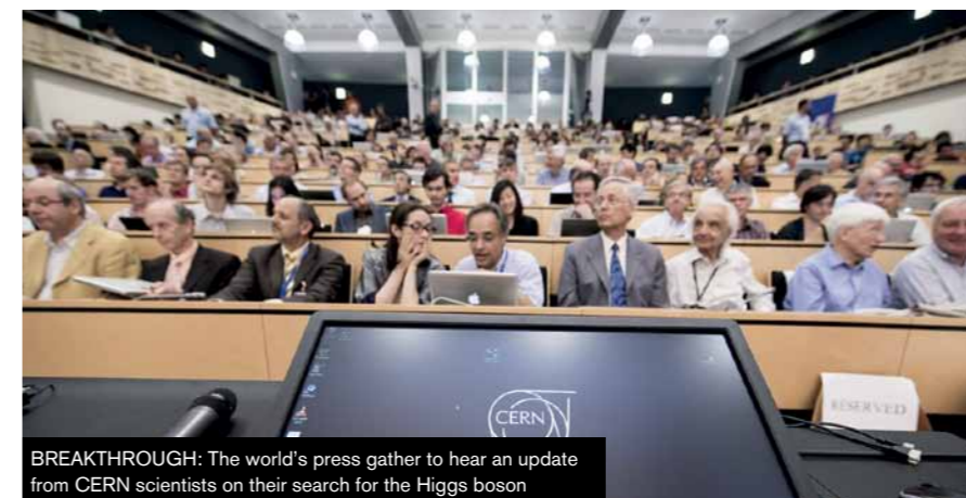
BREAKTHROUGH: The world's press gather to hear an update from CERN scientists on their search for the Higgs boson

University's leading role at CERN continues to transform understanding of the universe.