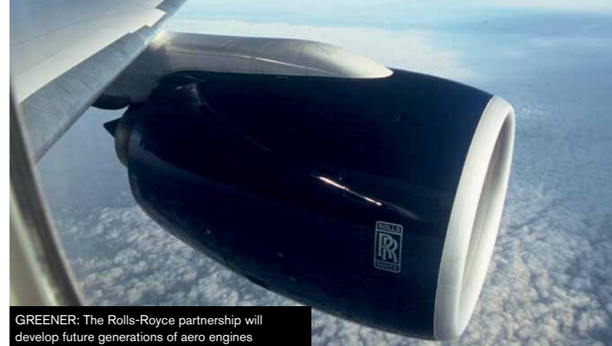
GREENER: The Rolls-Royce partnership will develop future generations of aero engines