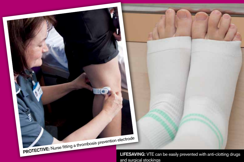
PROTECTIVE: Nurse fitting a thrombosis prevention electrode

To find out more and to keep up-to-date with the latest news, visit www.birmingham.ac.uk/alumni/news