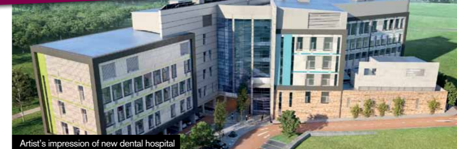
Artist's impression of new dental hospital