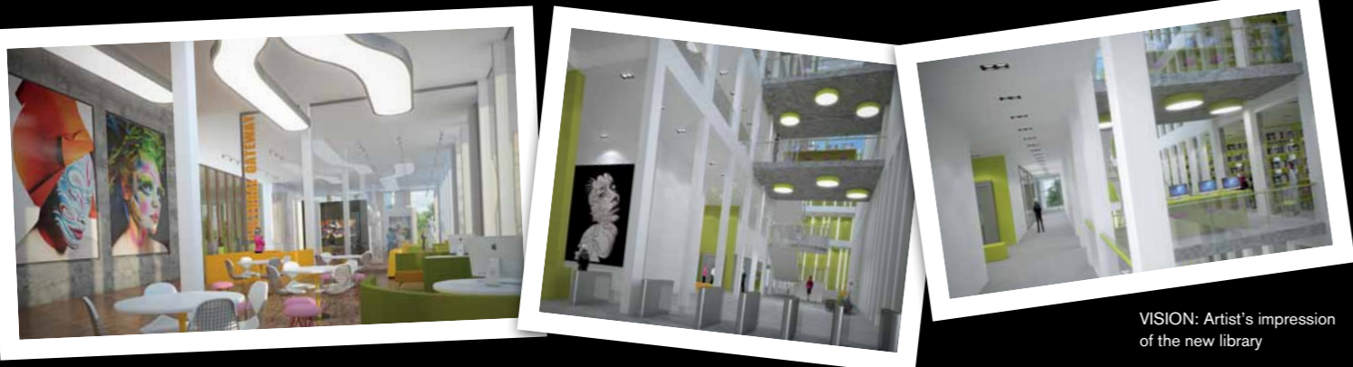
VISION: Artist's impression of the new library