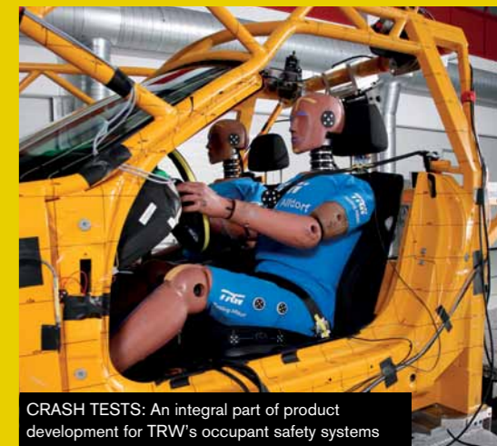
CRASH TESTS: An integral part of product development for TRW's occupant safety systems