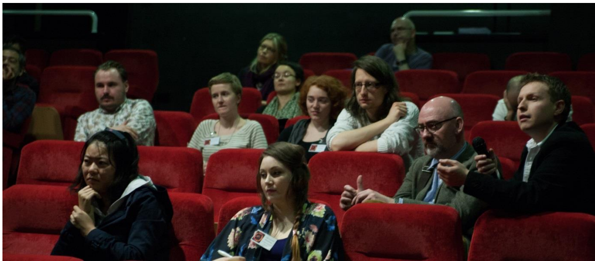
Audience interaction at the ‘Echoes of Excess’ industry panel.

The three-day conference was attended by 35 fee-paying delegates, together with 11 special guests and 12 volunteer staff from the University of Birmingham postgraduate community. Over a quarter of delegates hailed from outside the UK, with visitors coming from as far afield as Romania and Canada.