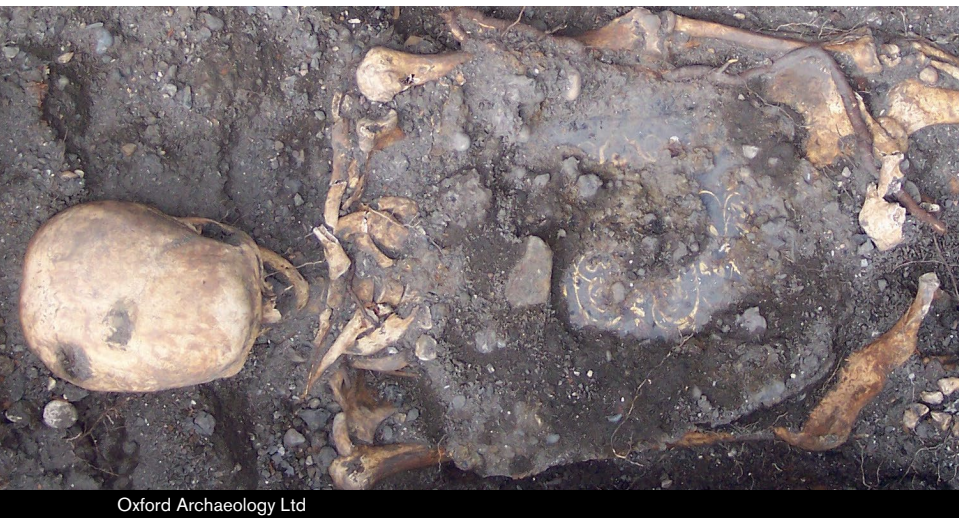
Oxford Archaeology Ltd