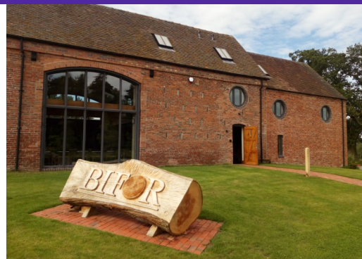
The exterior of the Long Barn

BIFoR FACE Facility, Norbury, Staffordshire, ST20 0FJ