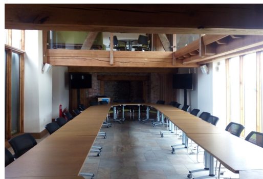
The meeting space holds 27 boardroom style, the mezzanine level available for breakout meetings