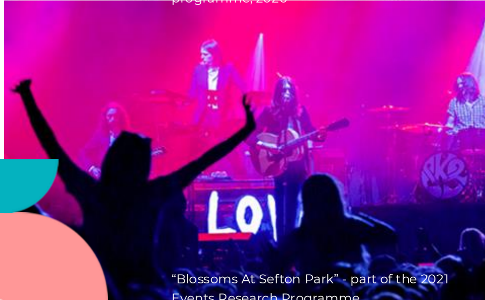
"Blossoms At Sefton Park" - part of the 2021 Events Research Programme