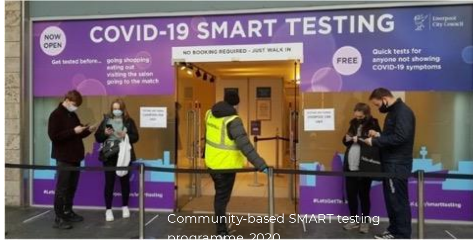
Community-based SMART testing programme, 2020