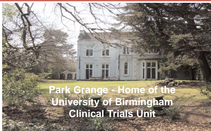
Park Grange - Home of the University of Birmingham Clinical Trials Unit