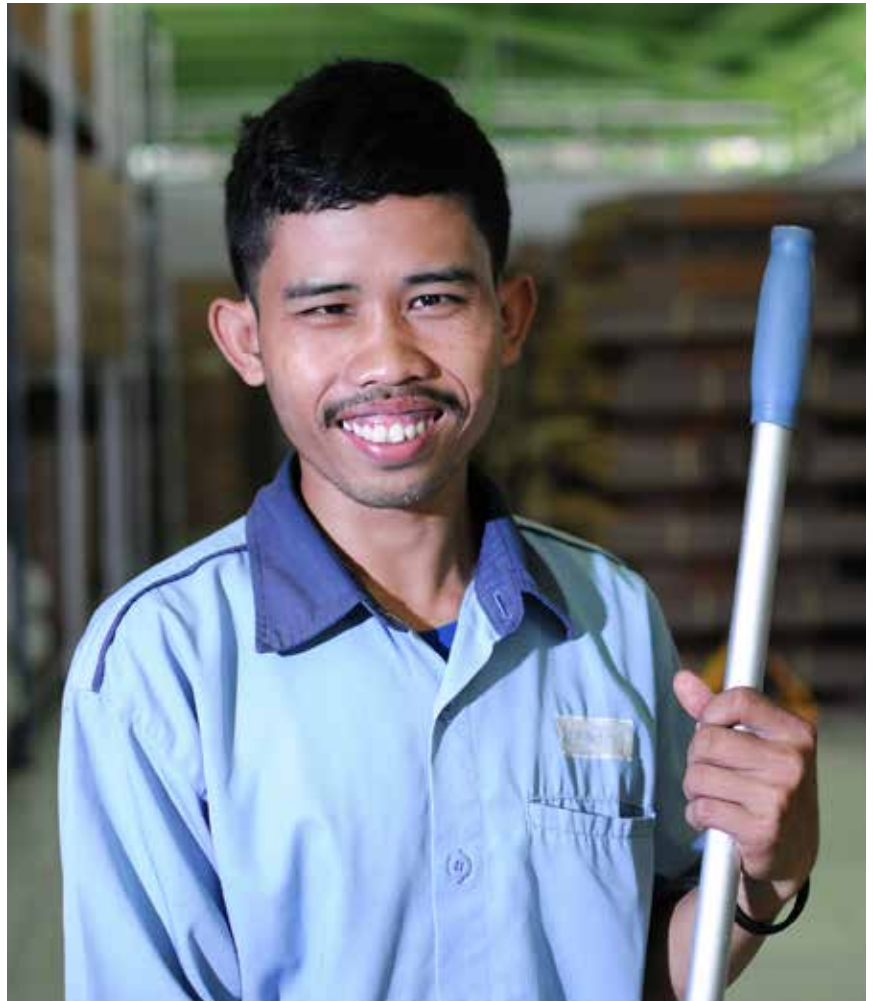
Factory worker, Indonesia

In this module, the early weeks focus on conceptual models of disability and the complex relationship between disability and poverty, before moving onto examine the role of the international disability movement in drawing attention to the injustices faced by disabled people around the world.