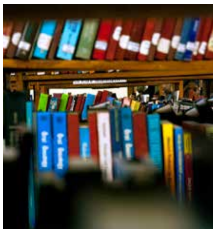
Library in Sri Lanka