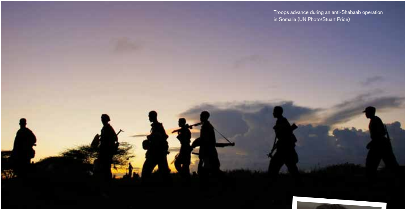
Troops advance during an anti-Shabaab operation in Somalia