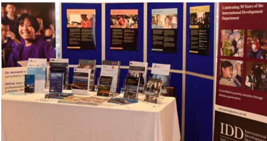
IDD stand at the University of Birmingham AGM