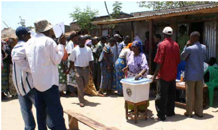
Left: Beach Management Unit (BMU) election

projects, but it's been challenging to keep co-management functioning since the last lake-wide project finished in 2010. This is not unusual, with co-management approaches struggling to deliver on sustainable fisheries and improved livelihoods in many parts of the world.