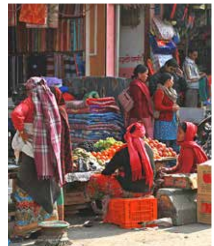
Storefront and vendors Kaski Nepal

The research provides a comprehensive picture of why people joined the movement in the first place and the impact of that decision on education, skills, and physical and mental health. At the same time, it also provides a picture of life in the cantonments following the 2006 Comprehensive Peace Agreement, including details of the social impacts, but also of the changing views of the leadership within the People's Liberation Army. It includes insight into the choices made when the time came to leave and enter civilian life. The research was carried out between one year and 18 months after their leaving the cantonment and so we have also been able to build up a picture of the nature of their employment, education and skills after their demobilisation, choices and location of their homes, the impact on their identity as former combatants and finally, the nature of their political engagement with the Maoist Party as civilians.