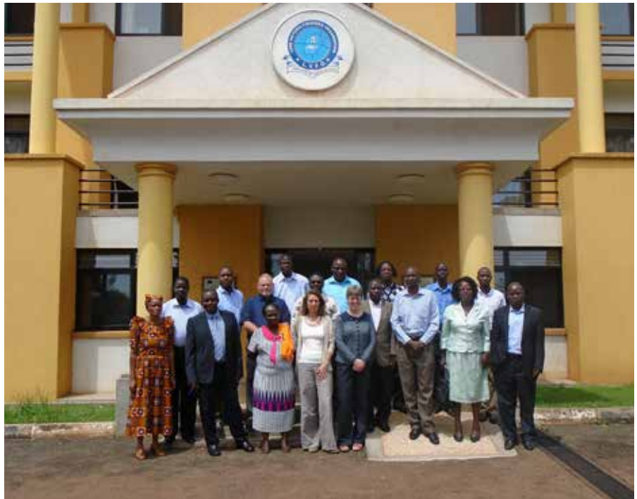
Above: Workshop participants outside the Lake Victoria Fisheries Organisation headquarters in Jinja, Uganda, April 2016

Co-management involves government sharing management with the users of the natural resource – in this case, everyone involved in the fisheries of Lake Victoria. During the early 2000s, Beach Management Units (BMUs) were formed to provide fishing communities with a representative organisation at the landing site. The initial process of adopting co-management was supported by donor