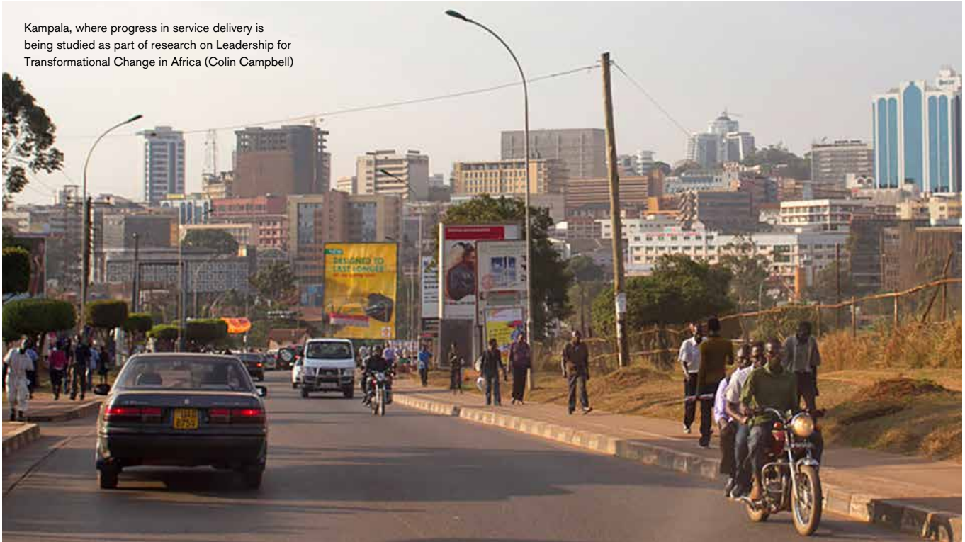
Kampala, where progress in service delivery is being studied as part of research on Leadership for Transformational Change in Africa