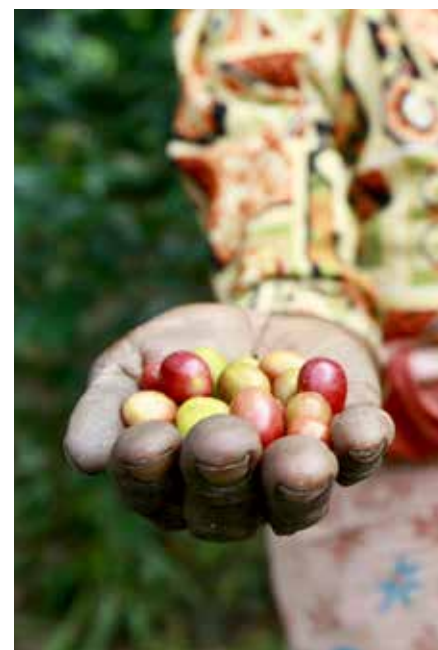
Coffee picker, Timor-Leste