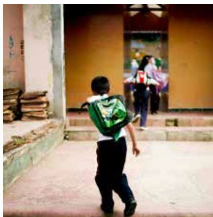
School, Colombia

GSDRC topic guides synthesise findings from rigorous research on critical areas of development policy. Eight new guides were added to the series this year, including: