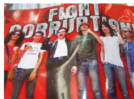
An anticorruption campaign in Indonesia