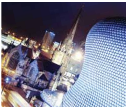
The Bullring in the heart of the city of Birmingham