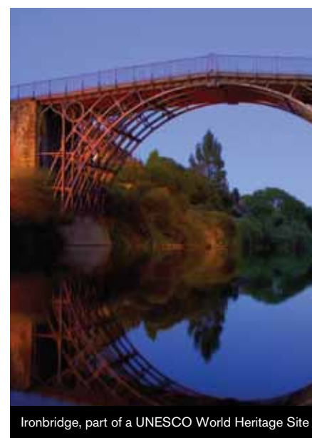
Ironbridge, part of a UNESCO World Heritage Site

Prior to its opening, a team of researchers from Birmingham visited the museum to carry out laser scanning of the building, to preserve a record of the historic site as it stood before further development for perpetuity. Not only does this demonstrate the cutting-edge technologies available to Birmingham scholars and the novel ways in which they can be used, but it also shows our commitment to participate in all aspects of Chicago’s public life in a positive and supportive fashion.