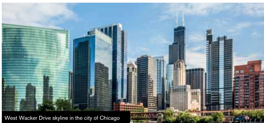
West Wacker Drive skyline in the city of Chicago