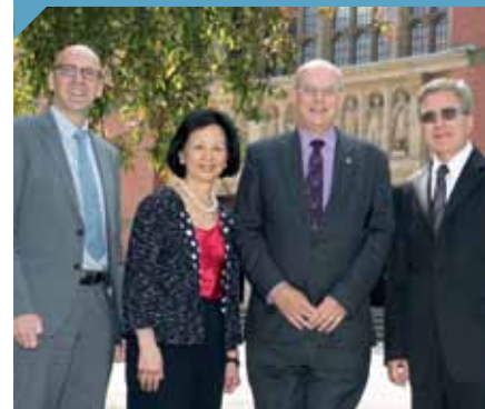
A Chancellor-led visit from the University of Illinois to Birmingham

Our most wide-ranging research links exist with the University of Illinois at Urbana-Champaign (UIUC), a globally elite public research-intensive university. By working together, Birmingham and UIUC are forming a broad and deep partnership through which a number of key research and teaching outcomes have already been achieved.