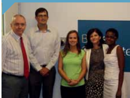
The British Consulate team in Chicago annually hosts a Birmingham student intern.

More broadly, we have developed a strong partnership with the British Consulate in Chicago and are viewed as leading the way in British university engagement in the region.