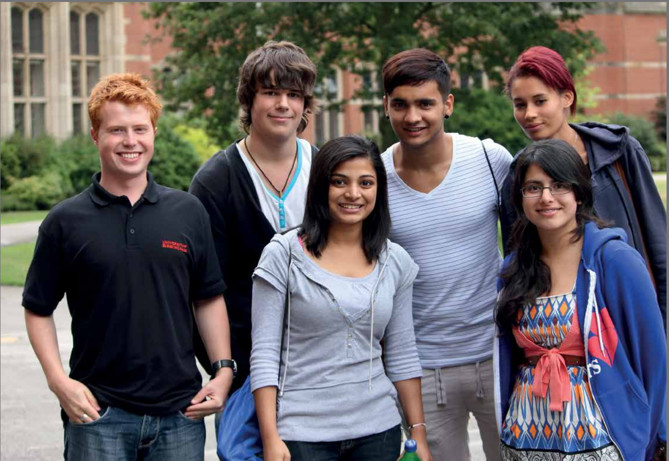
Students on Academic Enrichment Programme

The Outreach Team plays a key role in the Aimhigher West Midlands partnership, a network of 12 regional universities and colleges who work together to develop and deliver widening participation activities, and help schools engage more effectively in the support available. In addition to hosting the Aimhigher coordination team we are delivery partners in the initiative's collaborative Mentoring, UniFest summer school, Primary Outreach and Teacher CPD programmes. For more information visit www.aimhigherwm.ac.uk