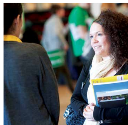
HE Guidance Event

We are keen to work with local schools and colleges to raise awareness and aspirations to higher education. Our activities are designed so that you can construct a programme for your