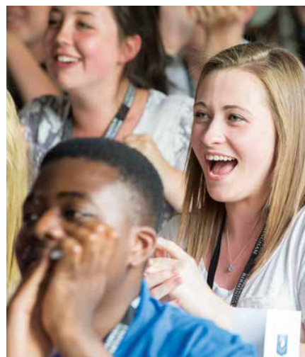
On-campus school visit

Young people's decisions relating to subject choices and progression post-16 can be critical to future progression to Higher Education; therefore we are keen to support schools with attendance at guidance and progression evenings where we can. We can also deliver a variety of presentations around why go to university, the importance of qualifications, how to choose a course, finance and student life, to support your work. Please contact us at outreach@contacts.bham.ac.uk if you would like us to attend an event at your school.