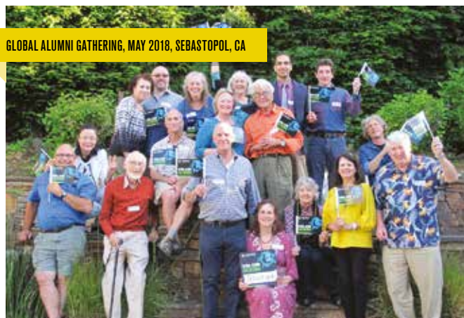
GLOBAL ALUMNI GATHERING, MAY 2018, SEBASTOPOL, CA

And groups of friends shared their memories of the University with fellow Birmingham graduates as part of the annual Global Alumni Gatherings in May, with events taking place on the East and West coast, as well as Atlanta, Georgia.