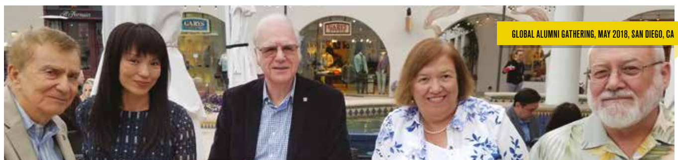
GLOBAL ALUMNI GATHERING, MAY 2018, SAN DIEGO, CA