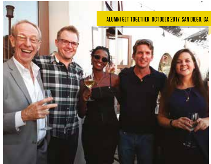
ALUMNI GET TOGETHER, OCTOBER 2017, SAN DIEGO, CA