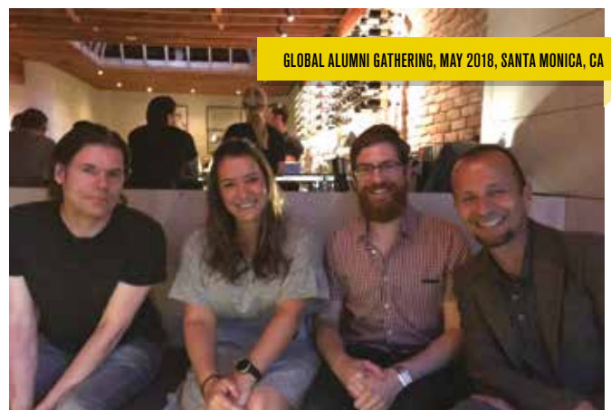
GLOBAL ALUMNI GATHERING, MAY 2018, SANTA MONICA, CA