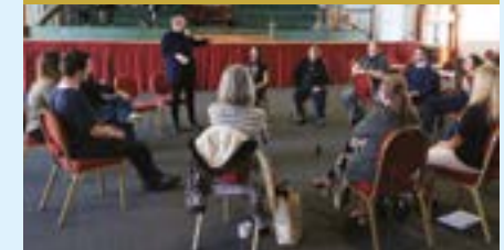
Underground Light Community Theatre workshop, participants are invited to think up topics for a political speech. May 2023.