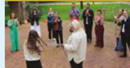
Citizens UK Brighton and Hove Chapter, delivery of speech on universal credit to workshop participants. August 2023.