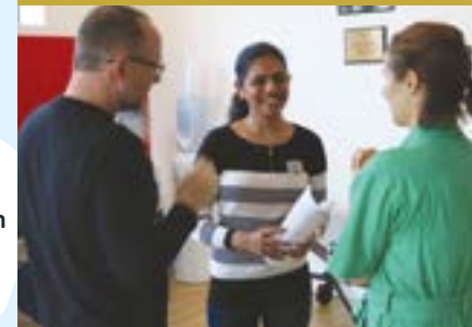
Theatre Royal Stratford East, London, workshop participant explaining her speech about women's rights to workshop facilitators. September 2023.