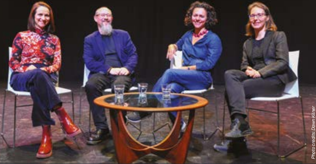
Project team, Manchester 22 Nov 2023. Left to right as below.