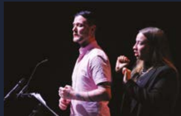
Speak Out! public event, Manchester; delivery of speech about how and why we should overcome intolerance. November 2023.