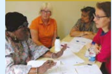
St. Hilda's East Community Centre, Tower Hamlets, East London, discussion of draft speech. May 2023.