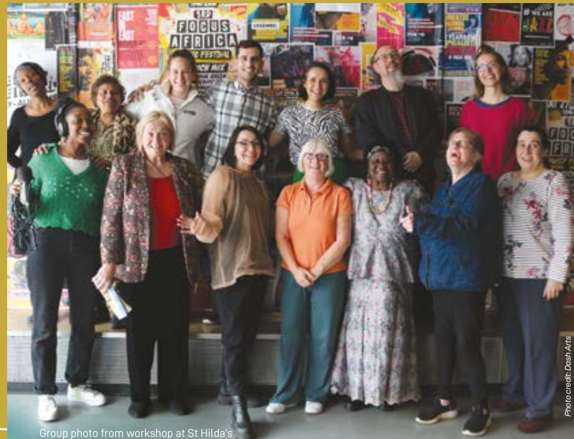
Group photo from workshop at St Hilda's Community Centre. May 2023.

Speak Out! Public events closing the project Speech! Speech! Dramatising Rhetorical Citizenship: video https://youtu.be/z7iJuDsFr9g .