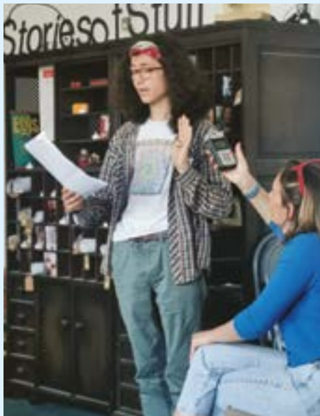
Writers' Block in Redruth, Cornwall; delivery of speech on regional independence to workshop participants. July 2023.

All photos on these pages credit: Dash Arts