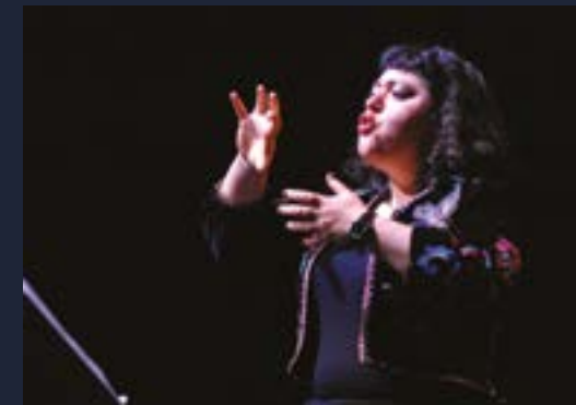
Speak Out! public event, Manchester; delivery of speech sharing personal experience as a deaf person in Iran and a refugee in the UK (BSL signing). November 2023.