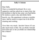
Figure 4 Sample Written Text 2 (Fusco, Garbide, Prodronu, 2006:43)

The social actor in this text mentions ... but the problem is that he has some very bad habits. He smokes a pack a day and drinks fairly heavily... . From this