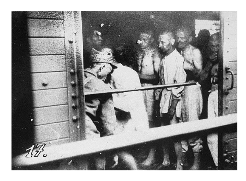
Romanian military physicians examine Jews during the stop of the lasi-Calarasi death train in Sabaoani.jpg. July 3, 1941.