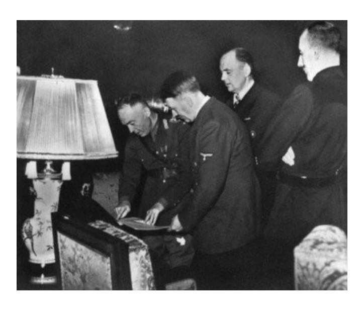
This image depicts Antonescu signing an agreement with Hitler on November 1940. From library of Congress in United States Holocaust Memorial Museum "Romania." Romania joins the Axis alliance. Holocaust Encyclopaedia.