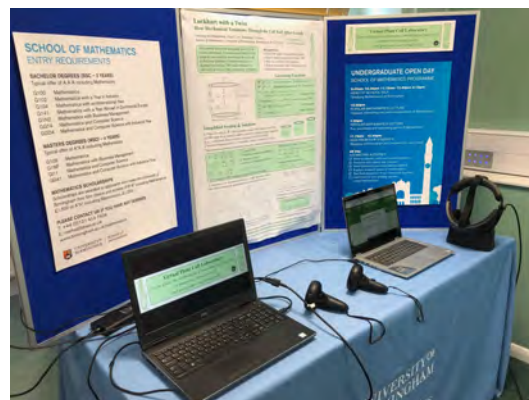
The Virtual Plant Cell Laboratory

We plan to engage with more students and wider audiences in future, promoting mathematical plant science everywhere we go. The UoB Alumni Impact Fund supports the development of the Virtual Plant Cell Lab.