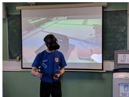
The Virtual Plant Cell Laboratory in operation