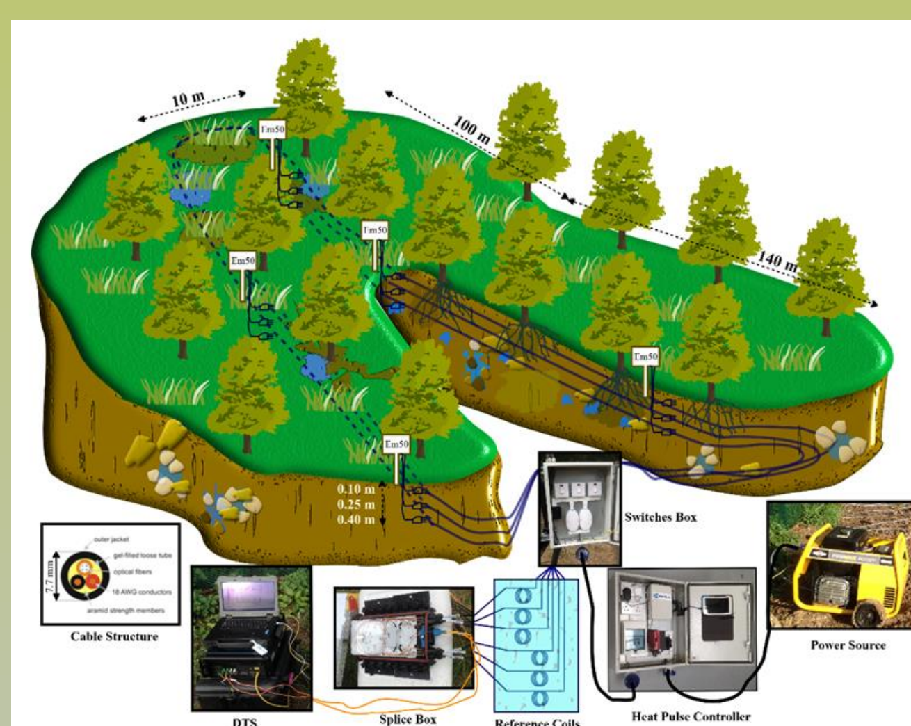
Fig.2 – A-DTS equipment and layout.