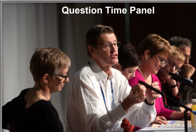
Question Time Panel