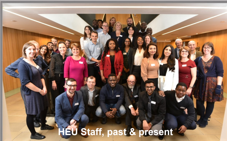
HEU Staff, past & present