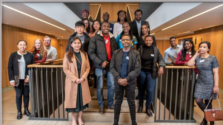
2019 MSc intake