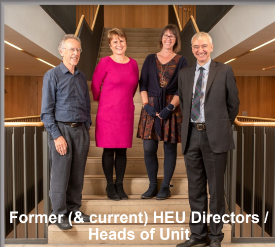
Former (& current) HEU Directors / Heads of Unit