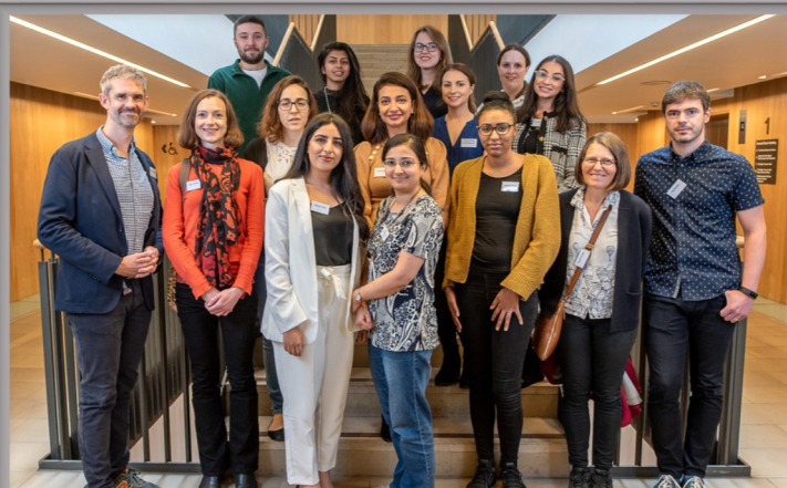
MSc Alumni 2015—2018