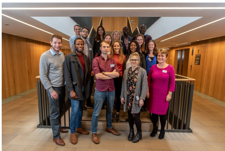
HEU PhD students, past and present