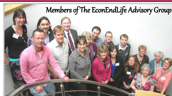
Members of The EconEndLife Advisory Group