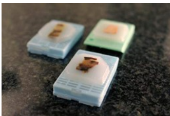
Figure 2. FFPE Blocks Containing Cancer Tissue

Even though the collection of samples is not mandatory, The PHITT Trial Team would like to give a big Thank You to all of the hard work that Sites have put into the collection and storage of patient samples, the completion of sample forms and organising the samples shipment to the various Analysis Laboratories, as part of the PHITT Trial.