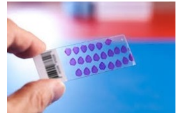
Figure 3. HE Slides Containing Cancer Tissue

However due to the current situation, any samples collected for IGTP, Spain, must be stored in conditions as described in the PHITT Laboratory Manual (v5.0 vd27-Jan-2020), as they cannot be shipped to them at the present. Also, fresh samples cannot be collected and shipped to the PDX Centres, at present. The PHITT Trial Team will advise when it is okay to ship certain PHITT patient samples