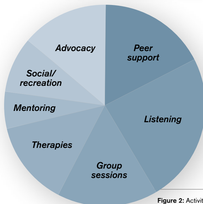
Figure 2: Activities provided by voluntary sector organisations that completed the survey

The approach of the voluntary sector is distinctive and can be characterised by its relational, and socially-oriented style of operation. Many participants commented on the compassion, humanity and kindness and how they felt less constrained by time. They valued the blurring of roles between staff, volunteers and peers, and particularly appreciated peer support and connecting with other people who shared a mental health crisis experience. Voluntary sector organisations compared very favourably with public sector services and were described as being more responsiveness and flexible to service user needs.