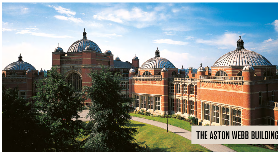
THE ASTON WEBB BUILDING

Students who attend a preessional course DO NOT take IELTS at the end of the course.