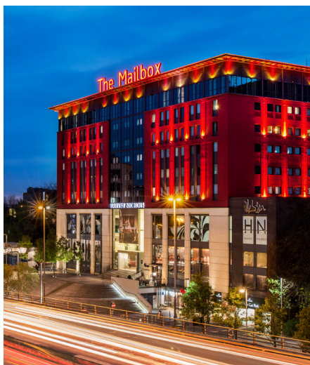
The Mailbox, Birmingham