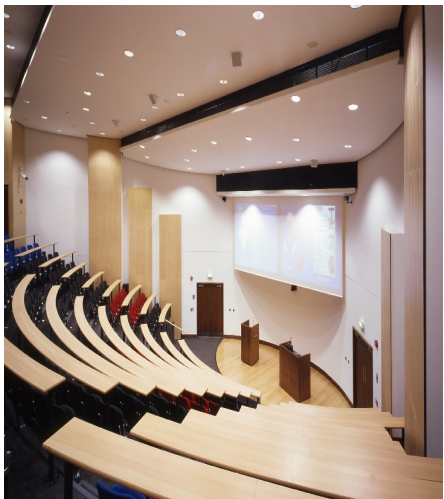
The Richard Deacon Lecture in the Teaching and Learning Building