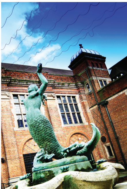
Mermaid fountain – The Guild (01)