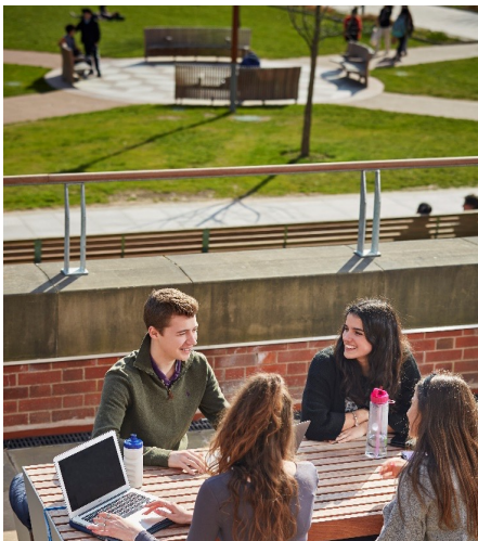
Outdoor Study Space in the Green Heart

On the opposite side, you can see our new Teaching and Learning Building (R22) which opened in January 2020. A hub for education, the facility provides a state-of-the-art teaching and social study space to support the modern learning experience at Birmingham. It consists of: A 500 seater lecture theatre, a 250 seater interactive lecture theatre, 10 seminar rooms for 30 students at a time, learning spaces for hundreds of students (which will include areas for individual study, collaborative group work and creative break-out sessions), and a café.