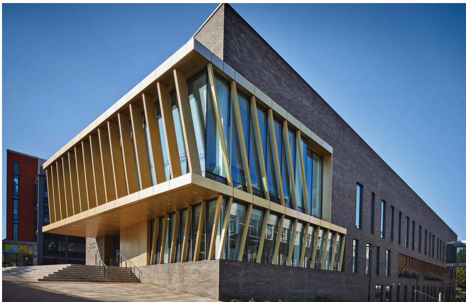
Collaborative Teaching Laboratory (R31)