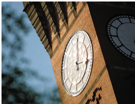
'Old Joe' clock tower

Looking across Chancellor's Court, you see the red brick Law Building (R1) and the architecturally distinctive Muirhead Tower (R21) rising up behind it. Following the Aston Webb Building round to your right, you will arrive at the Bramall Music Building (R12) .