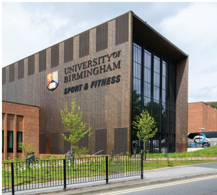
University of Birmingham Sport & Fitness