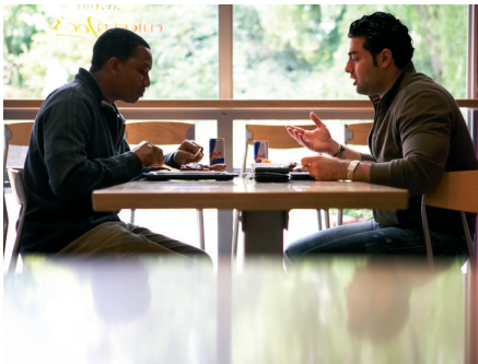
University Centre (R23)