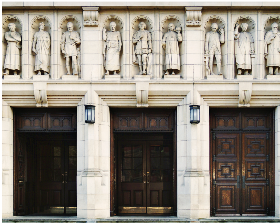
Entrance to Aston Webb Building (R6), featuring a frieze of nine figures from the worlds of art, philosophy, science and industry

As you walk through the campus, you will notice various sculptures which form part of our Sculpture Trail, running from the East Gate, where you can see the 1722 statue of King George I by Van Nost, through to the West Gate, where Sir Eduardo Paolozzi's Faraday stands. You can also see Ancestor I by Barbara Hepworth in University Square and William Bloye's Mermaid in the Guild courtyard.