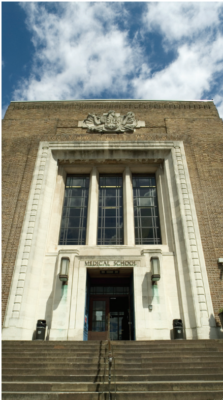
Medical School (B1)

You can also see the Medical School (B1) , which is across the main road from University station. The Medical School is a major international centre for education and research in medicine and medical sciences.