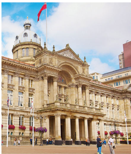
Birmingham Council House

We hope you have an enjoyable day here at the University of Birmingham and that you benefit from your campus tour. Information about our postgraduate open days and other events can be found on our website.