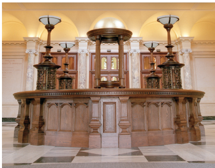
Aston Webb Reception (R6)