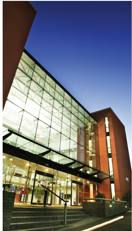
Murray Learning Centre (R28)