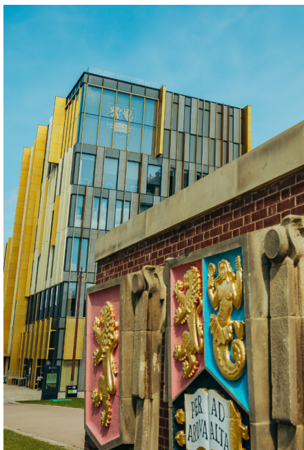
Our university crest from the original library (now found in the Green Heart) next to the new main library (R22)