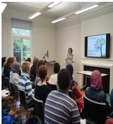
The Seminar Room

The University Graduate School (UGS) values and encourages postgraduate researcher-led personal and professional development and engagement activities including cultural celebrations, the annual Research Poster Conference and Images of Research and Study competitions as well as the Masters Consultancy Challenge and Postgraduate Enterprise School which offer you the opportunity to work in interdisciplinary teams, competing to provide innovative solutions to a real business problem.. The UGS also welcomes all postgraduate researchers to book space within Westmere to organise their own events.