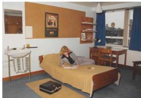
High Hall common room, UB/PH/A/1/3/87; student room at Mason Hall UA10/6

The new halls of residence built on the Vale site were intended to be run very differently from the older, smaller, halls like University House and Chancellor's Hall which tried, to varying degrees, to emulate aspects of the traditional Oxbridge collegiate structure and ethos. The University still hoped to foster a sense of community and integration, and the presence of academic staff in the new halls as Senior Common Room members and non-academic tutors was supposed to contribute to this aim. For most of the 1960s, 21 was the age of majority and so the University placed restrictions governing independence and behaviour on first year students living in the new halls of residence.