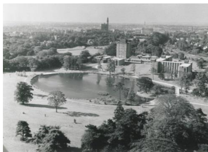
Halls of Residence on the Vale site, 1960s UA/10/6