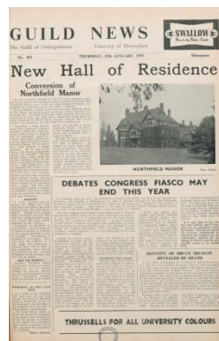
Students at Manor House, 1950s UB/HMH/A/1/3; Guild News article 1954 UB/GUILD/F/4

In 1945, Chancellor's Hall and University House were the only halls of residence available for students. University House continued to be popular with women students, but Chancellor's hall struggled to recruit and retain enough residents to make it profitable. Minutes of the University Halls of Residence committee mention complaints about the high cost of rooms, the poor standards of accommodation, and the distance from the Edgbaston campus.