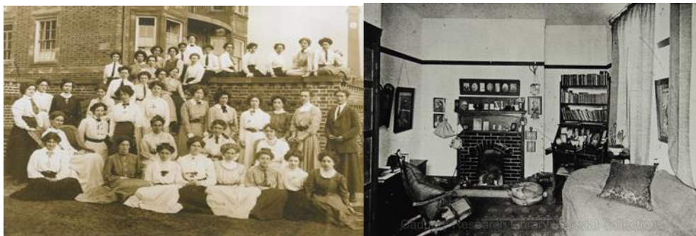
University House residents and interior UB/HUH/A/8/4-5

This guide contains an overview of the history of student accommodation provision at the University of Birmingham, gives details about the types of records the archive holds, and suggests some ways of using the records and topics for research