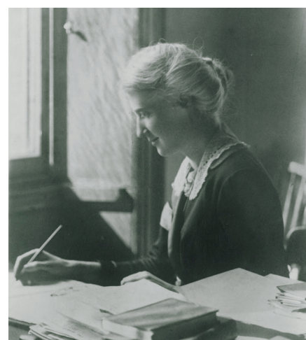
Eglantyne Jebb, one of the founders of SCF. SCF/PP/SP/1/JEB/1