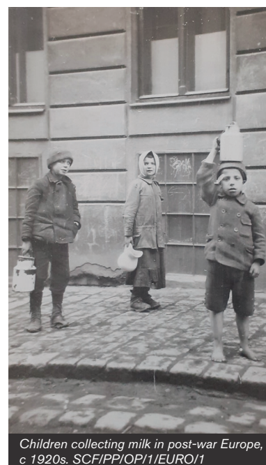
Children collecting milk in post-war Europe, c 1920s. SCF/PI/OP/1/EURO/1