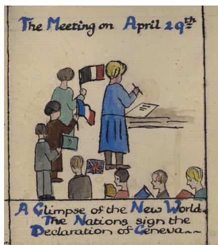
Concertina comic strip by Corrine de Candole, c 1925. SCF/EJ/9/2