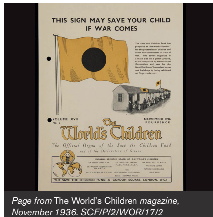
Page from The World's Children magazine, November 1936. SCF/P/2/WOR/17/2