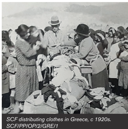
SCF distributing clothes in Greece, c 1920s. SCF/PP/OP/2/GRE/1

Today, SCF continues to work in more than 100 countries to support child health and learning.