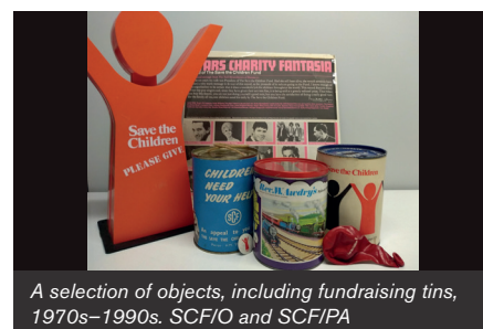
A selection of objects, including fundraising tins, 1970s-1990s. SCF/O and SCF/PA

SCF continued to respond to international crises, both natural disasters and conflict, including the Korean War, the 1956 Hungarian Revolution, the Biafra conflict, the 1984 famine in Ethiopia and the 1994 Rwandan Genocide.