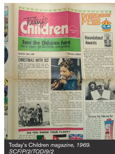
Today's Children magazine, 1969. SCF/PI2/TOD/9/2

Some records relating to the relationship between SCF and the UK government are available at The National Archives, and can also be found by searching the Discovery platform.