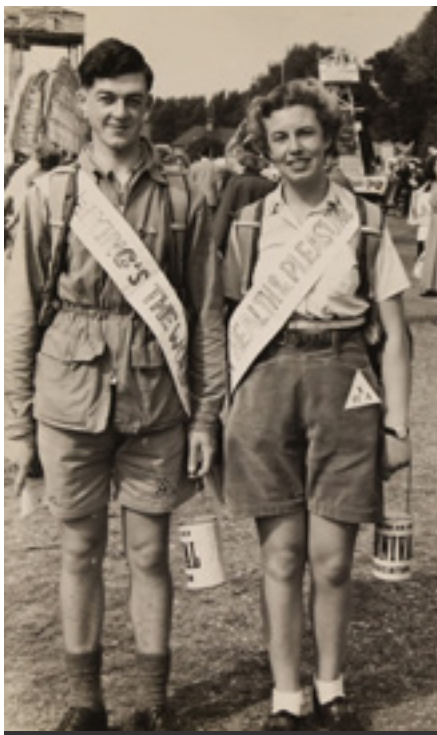
YHA volunteers at Southend-on-Sea Carnival, 1954. Ref YHA/LG/2/ALL/3