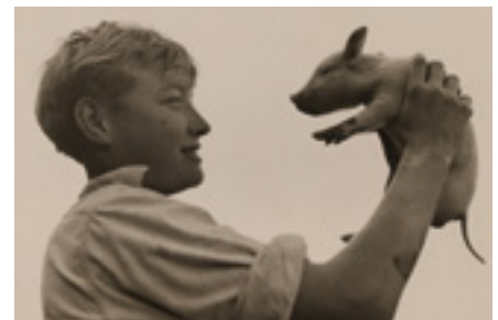
A member of the YMCA British Boys' for British Farms scheme holding a piglet. Ref YMCA/71/25/136

The scheme became recognised by the National Farmers Union and other agricultural bodies, and part funded by the Ministry of Agriculture. The scheme became a forerunner to Farm Institutes and Agricultural Colleges.